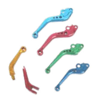
TREATMENT WITH DIFFERENT COLORS